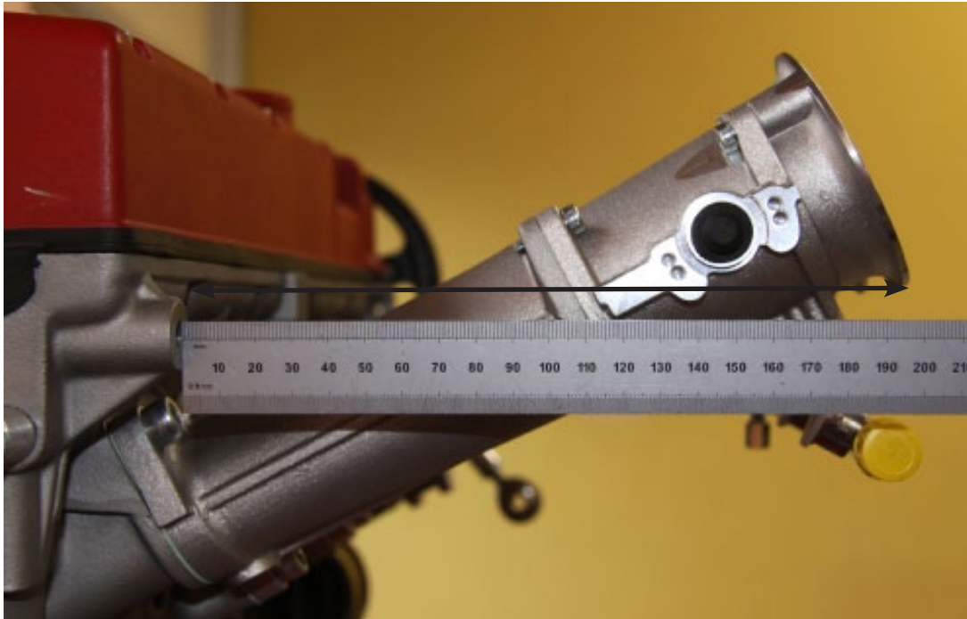
Head to edge of air horn - 200mm Air horn depth - 19mm