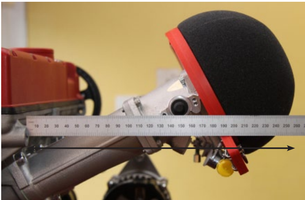
Head to outside edge of air filter - approx 260mm