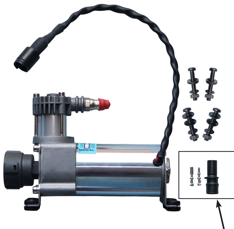
Male connector for wiring harness

Connect the male connector that is supplied with the kit to your wiring harness. The socket in the connector is for the 12v feed.